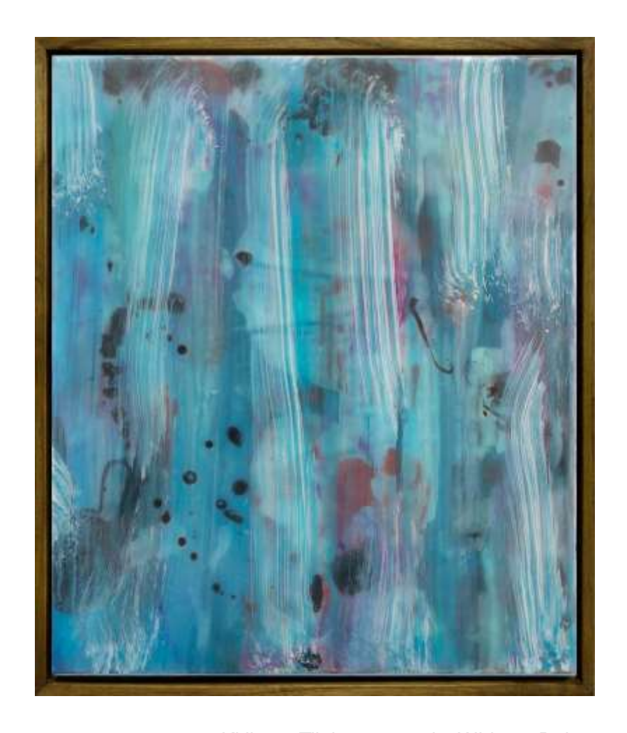
Kitikong Tilokwattanotai – Whisper Rain Acrylic and lacquer on canvas 2023 – 33 X 28 cm Courtesy galerie arnaud Lebecq