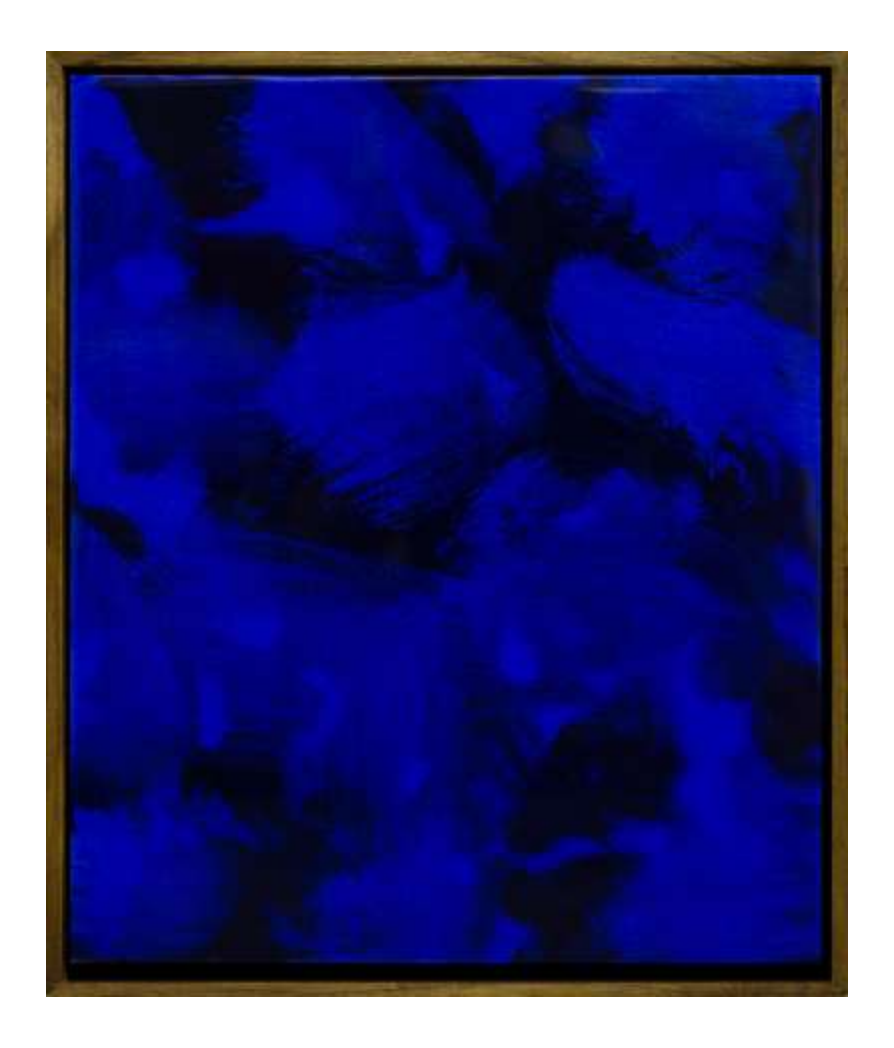
Kitikong Tilokwattanotai – Blue Shouting Acrylic and lacquer on canvas 2023 – 33 X 28 cm