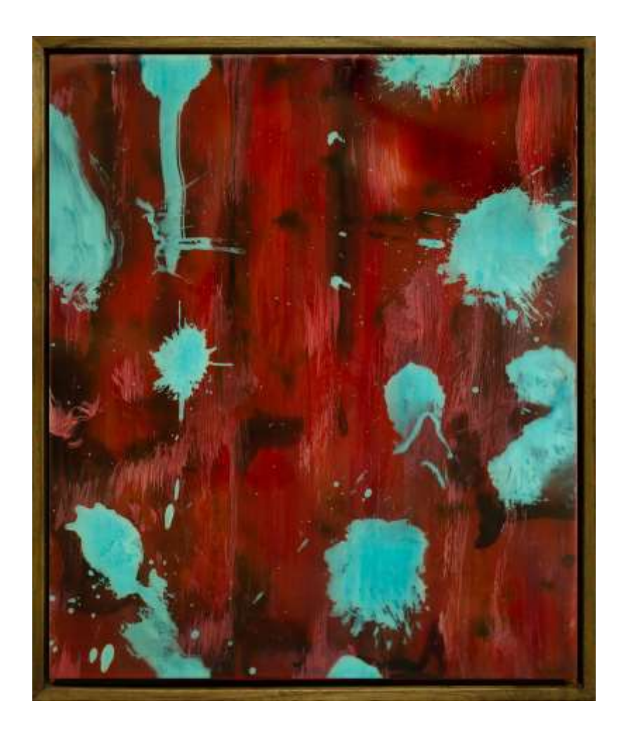
Kitikong Tilokwattanotai – Blue Splash Acrylic and lacquer on canvas 2023 – 33 X 28 cm